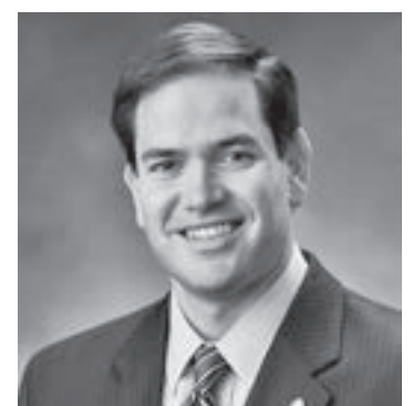
Senator Marco Rubio