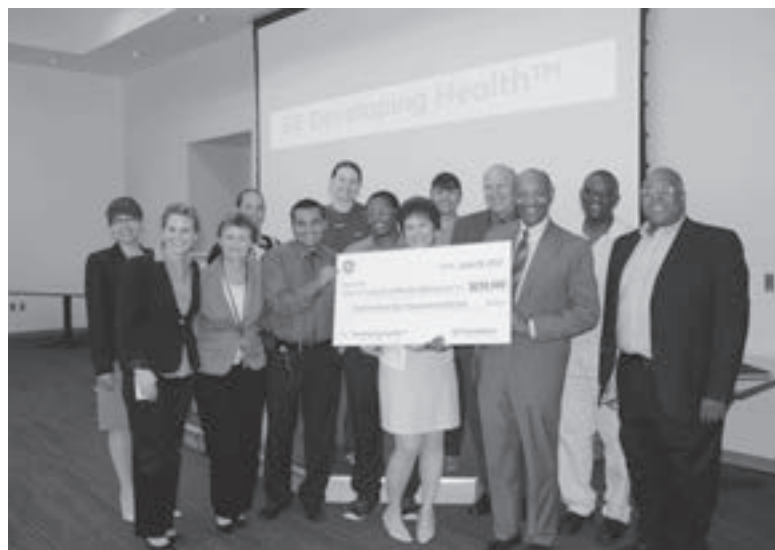
Southside Community Health Services staff and leadership

St. Croix Family Medical Center 5640 Memorial Avenue N, Suite B Stillwater, MN 55082 651-430-1880