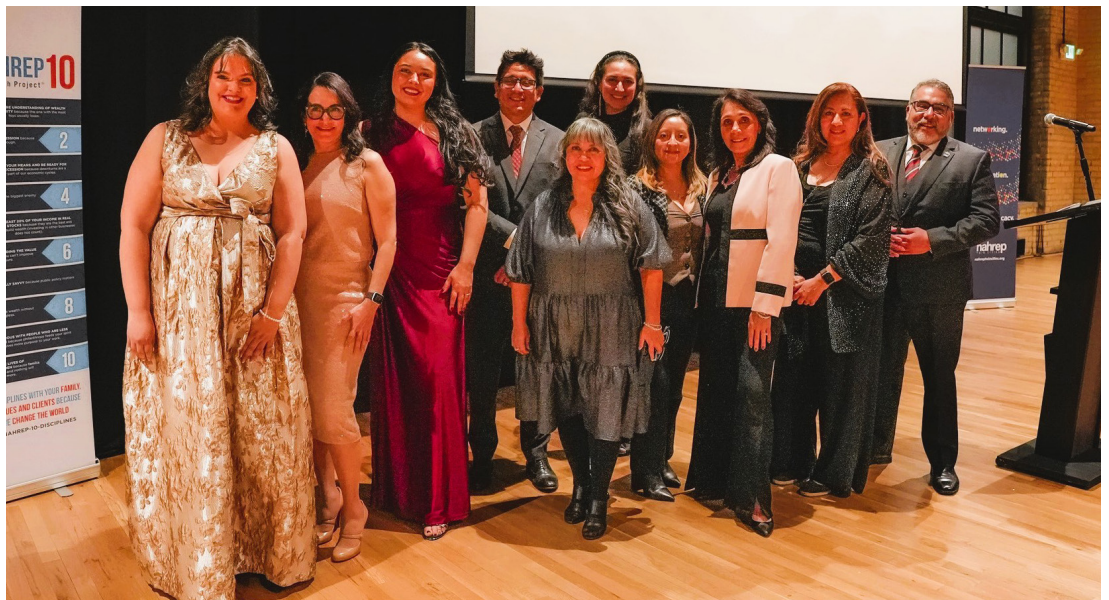
NAHREP Twin Cities 2026 President and Board of Directors