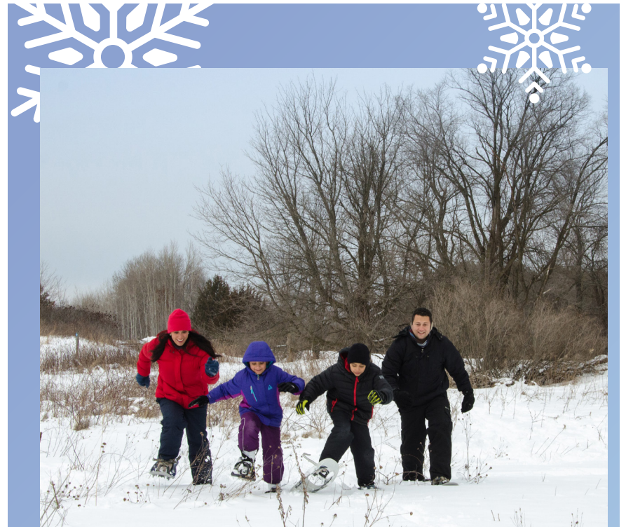
Snowshoes at Afton state park

Generally, reservations for winter overnight lodging fill quickly on weekends. If you feel a need to try something new for a couple days, look no further than your nearest state park. Lean into winter, which has made a bold appearance this season.