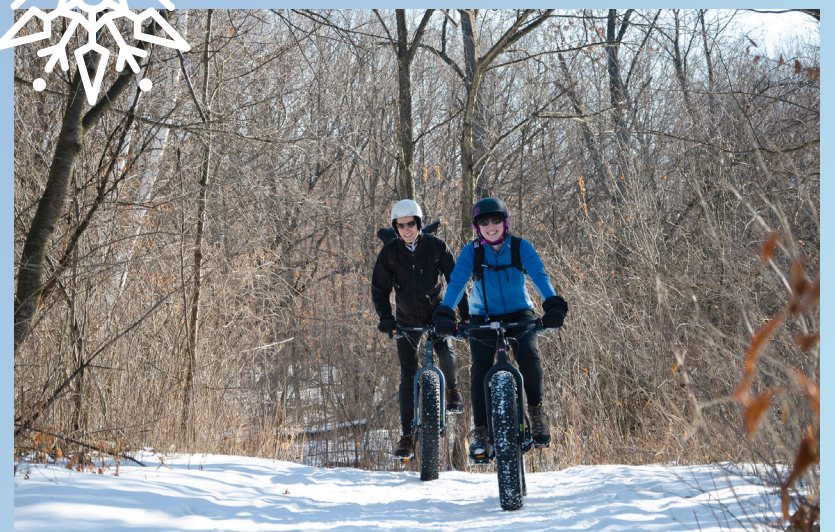
Fat tire biking at Lake Maria State Park