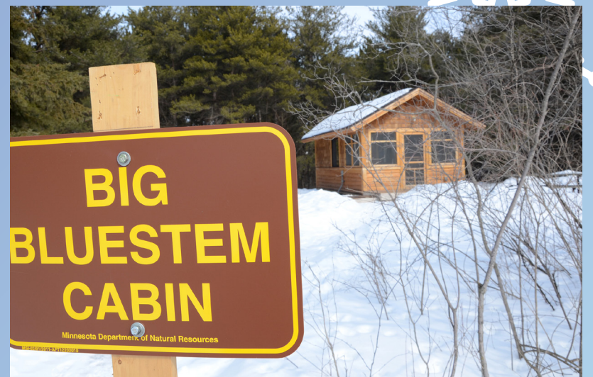
A camper cabin at Afton State Park